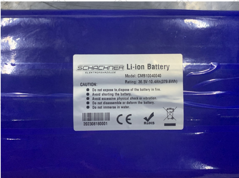
Figure 4 Battery Label (电池标签)