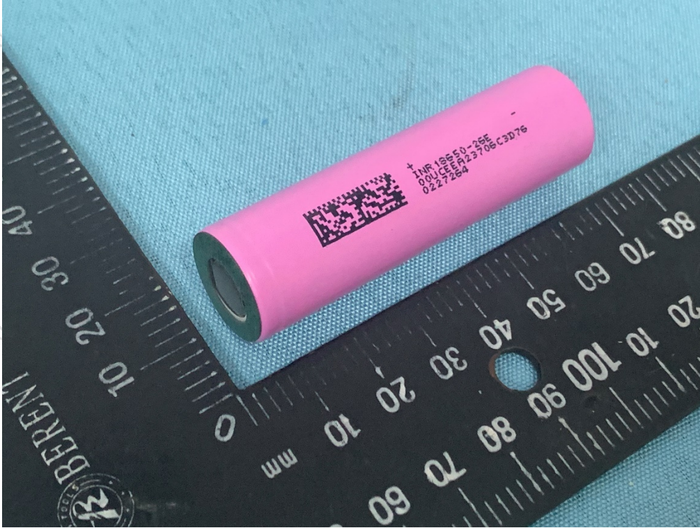
Figure 3 Overall view of cell (电芯图)